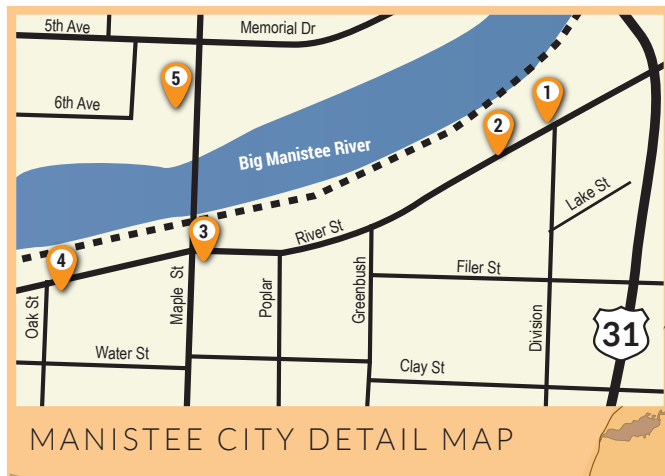
MANISTEE CITY DETAIL MAP

Explore the 11 local Beer, Wine and Spirits establishments that make up the Manistee County area Brew and Spirits Tour. This self-guided tour will take you along Lake Michigan and through the Manistee National Forest to all of the area's most popular craft/artisan hot spots.